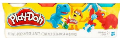
1 pack of 4 Play-Doh (Any color combination)