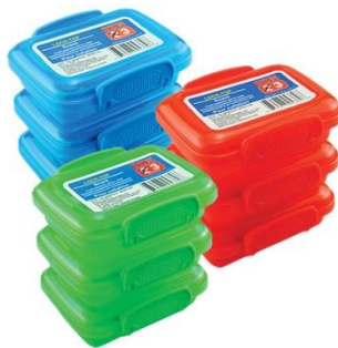
1 pack of Lock-Top Snack containers (Dollar Tree 1 )