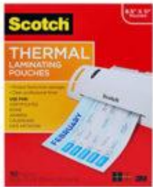
1 package of Thermal Laminating Sheets