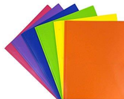
1 multicolored package of poly vinyl folders