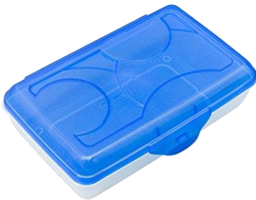
1 Pencil Box (Do not label)