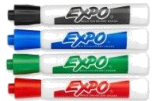
2 packs dry erase markers- 1 fat pack, 1 skinny black marker pack