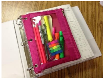
1 Zipper Pencil Pouch that can go in a 3 ring binder