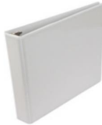
1 1/2 inch binder with clear cover (to slide papers in)