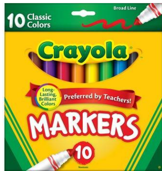
2 packs of 10 Crayola Markers