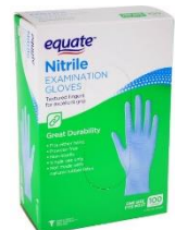
One (1) box of gloves (latex free)