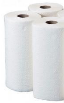
2 pack of paper towels