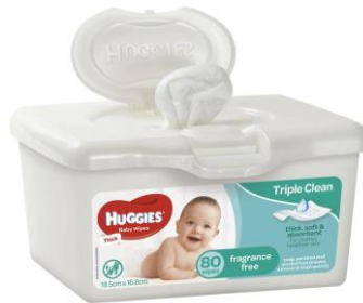
3 packages of Baby Wipes