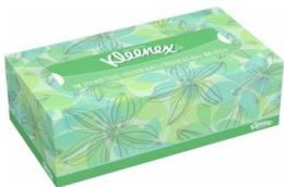
2 boxes of tissues