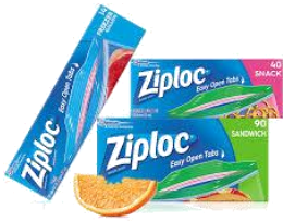
1 box Snack size