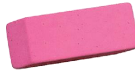
1 pack pink erasers