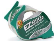
1 roll packing tape