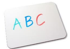
Dry Erase Board, dry erase markers and eraser