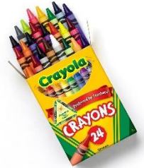
1 box crayons